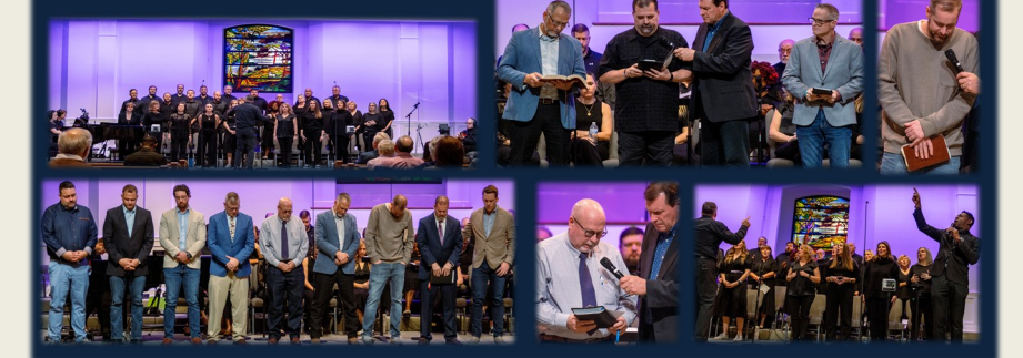
Scenes from CALL TO PRAYER 2025

Throughout the evening the choirs of Trinity Heights, First Blanchard, and Gospel Light will lead us in worship. Over two dozen pastors and laymen will be reading Scripture and leading us in corporate prayer. Don't miss a great evening of encouragement, praise and prayer. I'm looking forward to seeing you this Sunday evening at Trinity Heights at 6 pm.