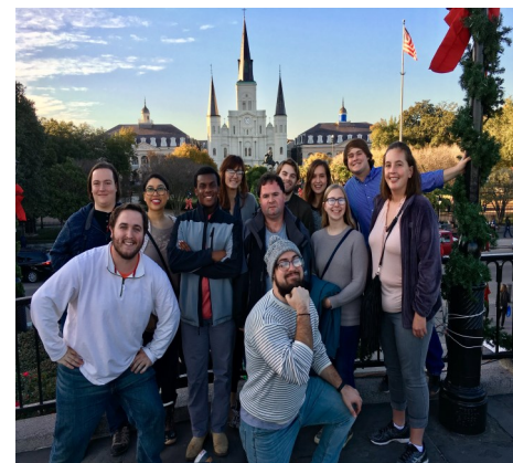
December 2017 Mission trip to South Louisiana