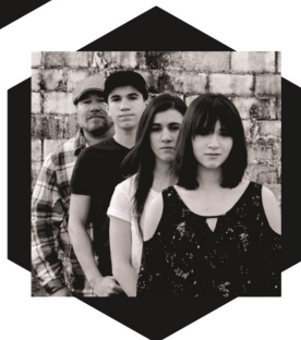
BROKEN VESSELS WORSHIP BAND