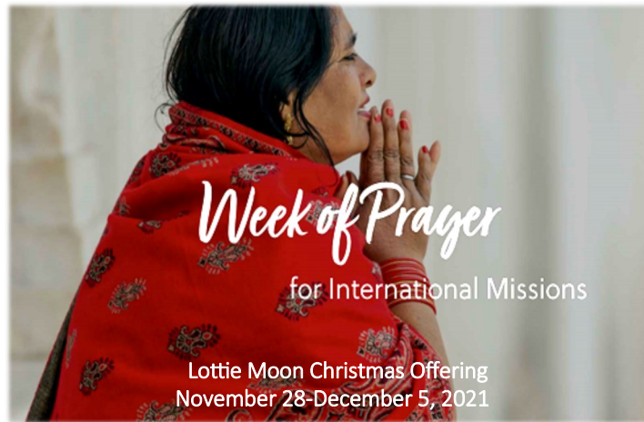
Lottie Moon Christmas Offering November 28-December 5, 2021

Please RSVP 318-686-5736 carlene@nwlba.org