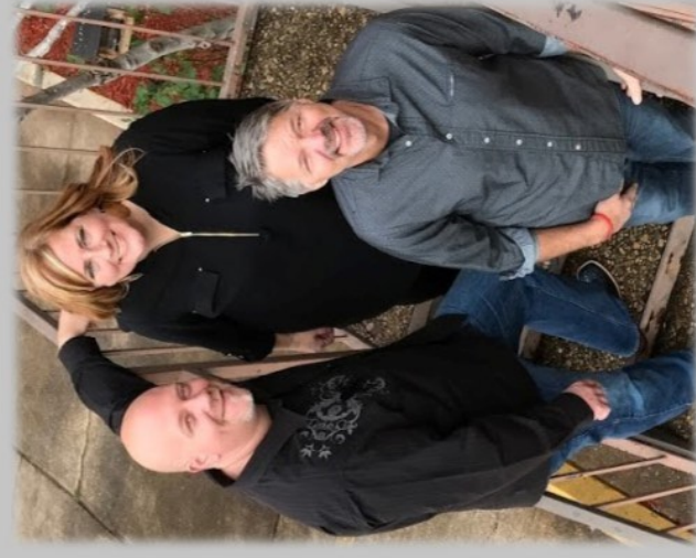
Music by: TRINITAS

LOG ON TO FIRST BAPTIST KEITHVILLE FACEBOOK TO VIEW ANNUAL MEETING LIVE