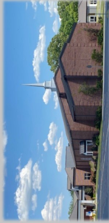
First Baptist Keithville