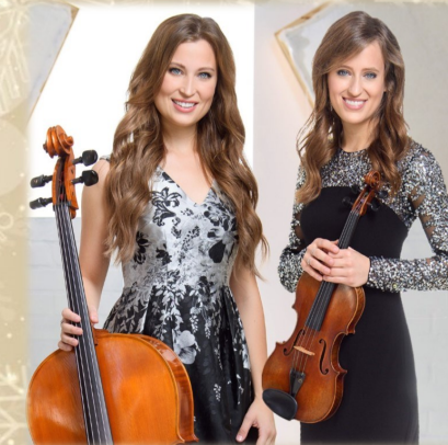
THE FOTO SISTERS